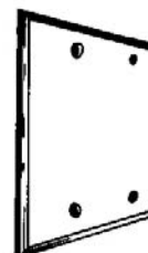
TP7296 – TP7298